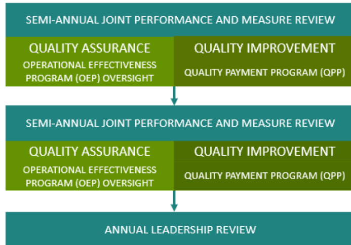
Figure 3 - Quality Improvement