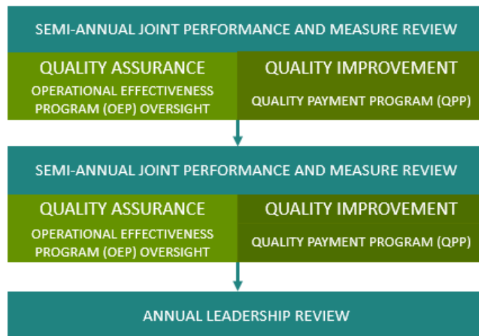
Figure 3 - Quality Improvement

Following the second of these J-PAM meetings, results will be brought forward to the QSLT. Teams will share their key findings and make recommendations for adjustments to either assurance or improvement activities that may be executed in the next performance year. The QSLT will have final authority to approve recommendations, including adjustments to performance measurements.